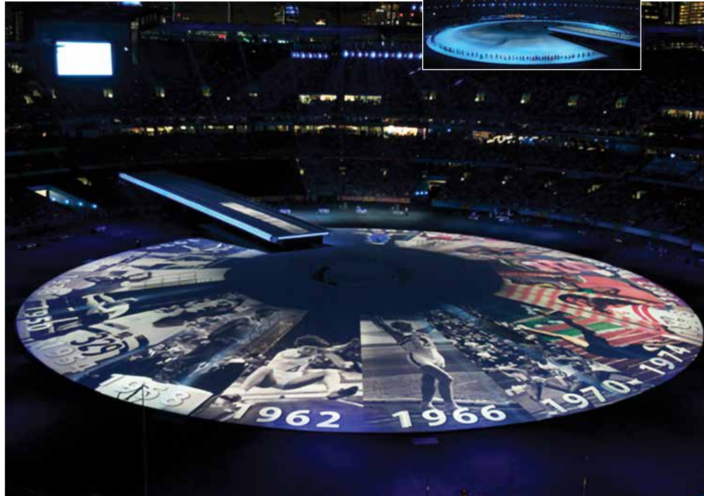
"The XVIII Commonwealth Games opening and closing ceremonies."