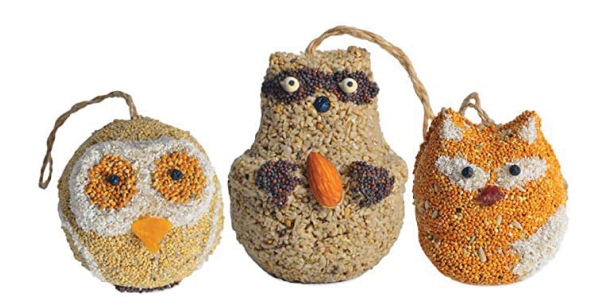
Gifts Made Out of Bird Seed