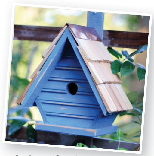
Gift a Bird House