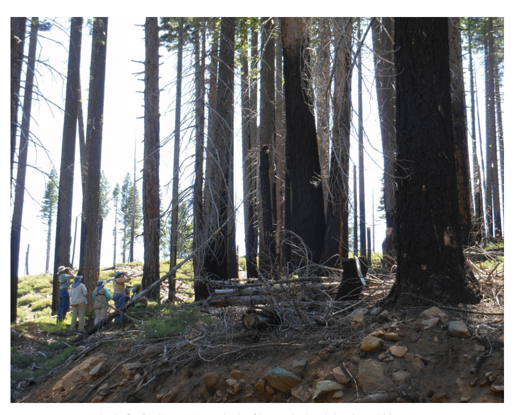
Let's Go Birding 2013 tour in the Sierras. At the sight of an old forest burn, participants look for Black-backed Woodpeckers.

Fire is a natural part of almost every California ecosystem and is important to its health. But the intense, frequent fires that California has seen in recent years are not normal, and sometimes not