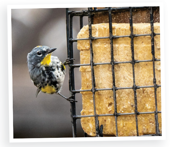
Yellow-rumped Warbler at suet feeder – Nancy Turek

Project FeederWatch is a joint project of the Cornell Lab of Ornithology and Bird Studies Canada. It's a fun way to learn about your backyard birds and contribute to a 30+ year-and-running data-set of bird population changes. Project FeederWatch turns your love of feeding birds into scientific discoveries.