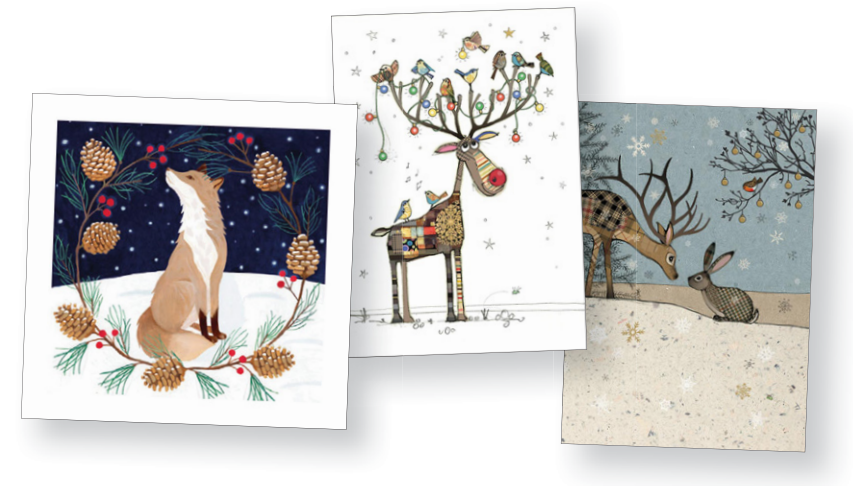
Come Check out Our Holiday Card Selection