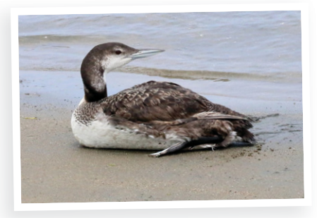
Pacific Loon