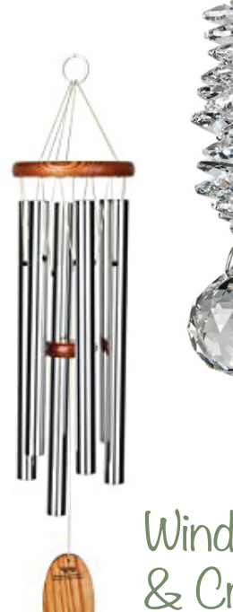
Wind Chimes & Crystals