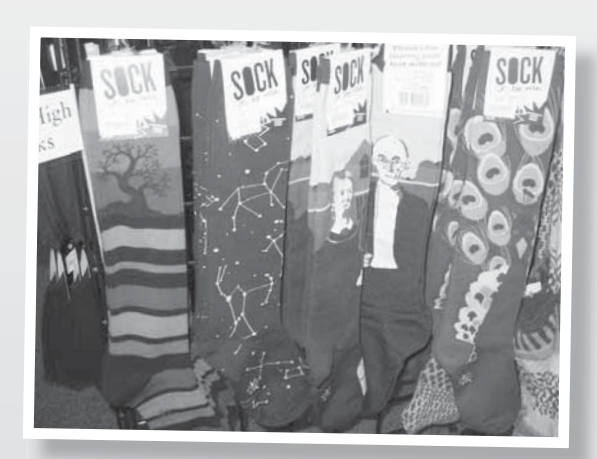
Sock-it-to-me knee-highs and other socks