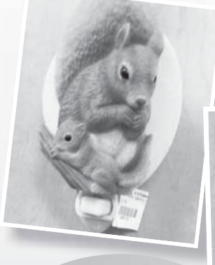
Night Lights by Ibis & Orchid