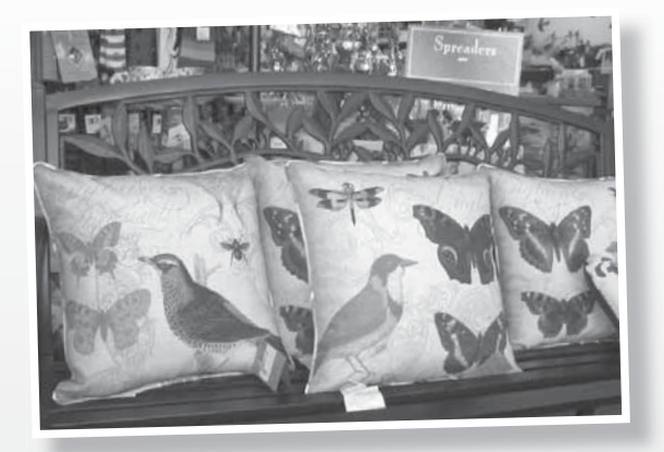
Bench and pillows

lots of our local birds beautiful graphics