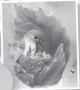
New Nightlights from Ibis & Orchid