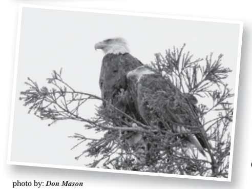
Bald eagles are an interesting bird to observe, as they are very opportunistic when sharing habitat with ospreys, which they do at both Lexington and Vasona. Many times they will follow a hunting osprey and when the osprey catches a fish, the eagle swoops in to claim the prize as its own.