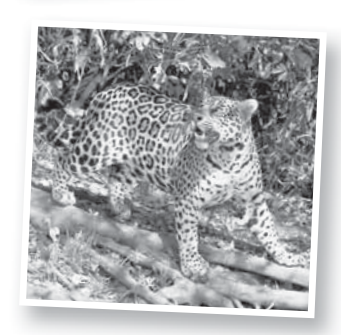
Photo Presentation, Explore the wildlife of Brazil with Judy Bingman

Thursday, April 17, 2014 6:30 – 7:30pm (Note time change)