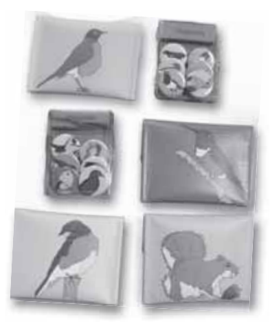
Pouches and magnets by local artist using vinyl banner leftovers.