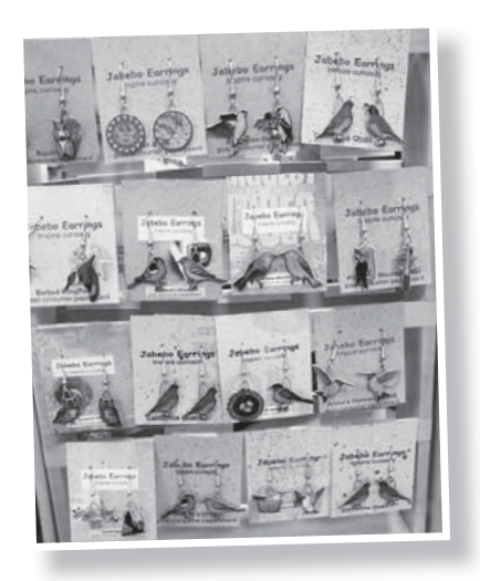
Jabebo Earrings made of recycled cereal boxes - lots of our local birds,

lots of our local birds beautiful graphics