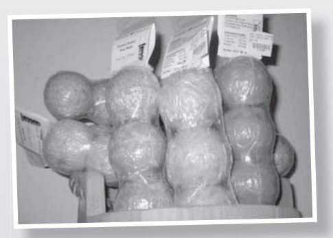
Customer Request Suet balls and their feeders.