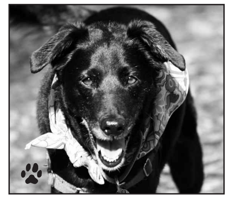
Remember me well! 10/18/2000 to 9/14/2011