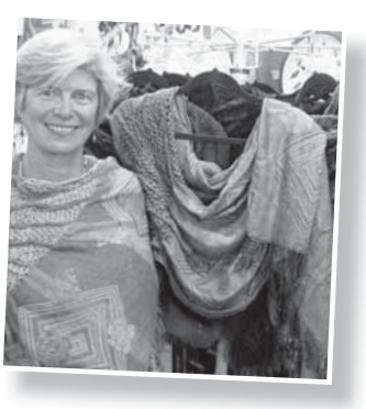
Pucker Shawls New shipment of beautiful reversable shawls in many different color-ways.