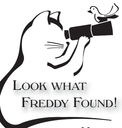
FOR THE HOLIDAYS