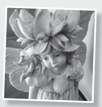
Fairies – Her face is very sweet! Many customers have requested fairies.