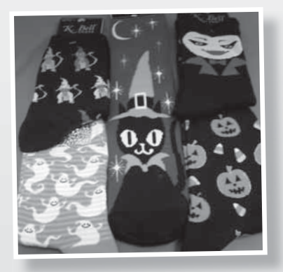
Halloween socks Of goolies and ghosties and things that go bump in the night!