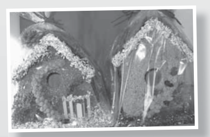
Seed Houses Wooden bird houses covered in seed for wrens, chickadees, and bluebirds.