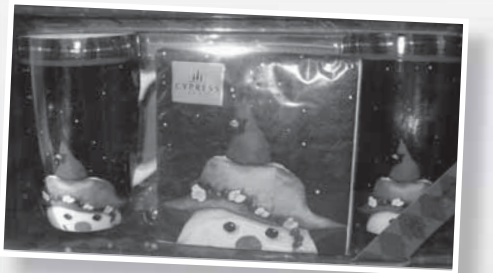
Table Top Christmas – Gift sets, Pitchers, Plates. Make your holiday table cheerful!