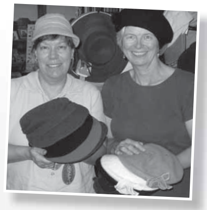
Berets and wool caps This year, in addition to our popular wool cloche hats, we have added caps and berets in many colors.

New earrings and bracelets in recycled copper by an artist couple in Washington State.