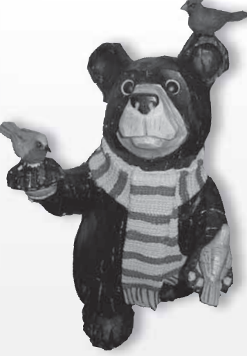
Bears and Birds in the woods Couldn't resist this charming fellow!