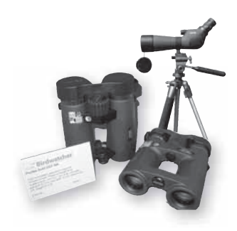
All optics will be 10% off and limited to stock on hand