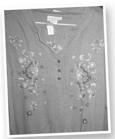
More Embroidered Shirts from Guatemala