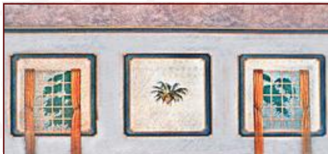
32-I. Bedroom or Powder Room 43' x 21' - 36 lbs Walls with two draped non-practical windows.

Give us a call, and let us put a century of industry knowledge to work for you!