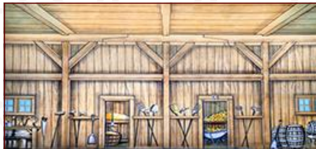
57-IA. Barn 32' x 21'6" - 34 lbs Rustic barn siding, wooden beams and open ceiling with two corn and grain bins and implements.