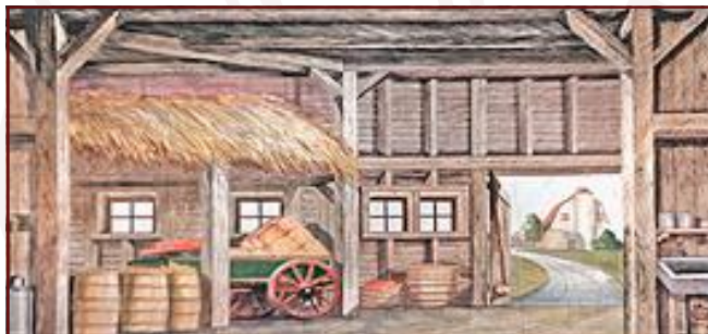
57-I. Barn 30' x 16' - 23 lbs Rustic barn interior with filled hay loft, barrels, and wagon. Natural barn siding.