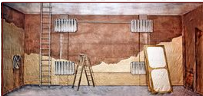
65-I. Backstage 43' x 20' - 37 lbs Backwall of stage showing radiators, ladder, flats and arbor.