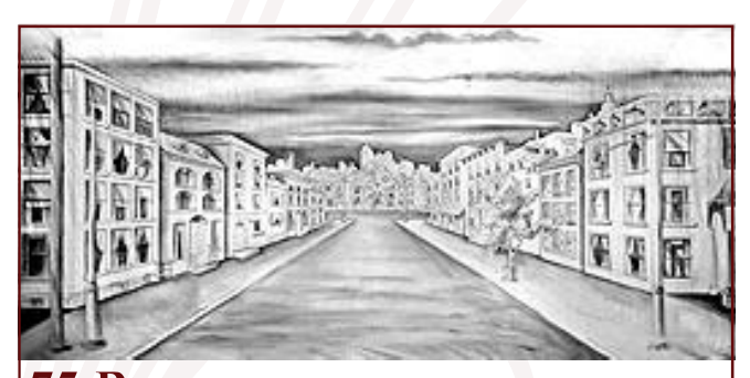
75-B. Old Time Street 43' x 21' - 42 lbs Black-and-white charcoal sketch looking up city street, lined with brick and stone buildings.

All images Copyright ©2005 - 2015 Schell Scenic Studio, Inc. Reproduction without permission is strictly prohibited. Images are intended for reference use only. Due to variations in monitors and printers, accurate color representation is neither implied nor guaranteed.