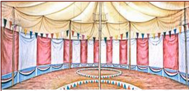
12-IC. Circus 43' x 21' - 37 lbs Tent interior with red and white panels, tan canvas roof, mulitcolored