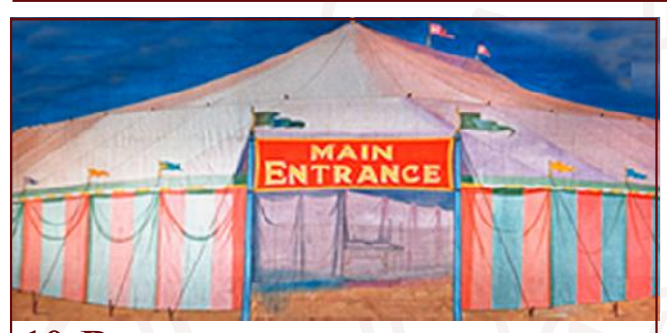
10-B. Circus Main Entrance 39' x 21' - 28 lbs Big Top with entrance sign, featuring practical center opening.