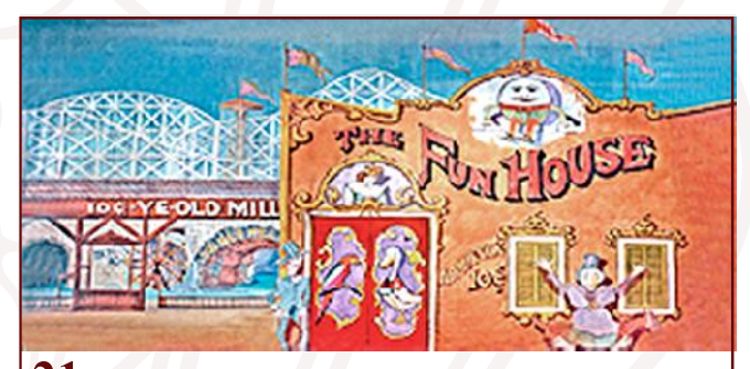
21. Amusement Park Features fun house and roller coaster.