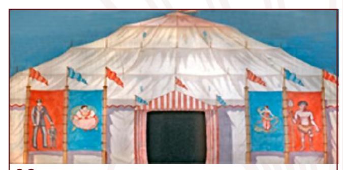
23. Side Show 38' x 20'6" - 28 lbs Tent entrance with practical center door. Opening is approximately 9'Wx9'H.