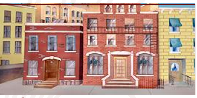
75-C. Tenement Street 43' x 21' - 36 lbs Bright and stone apartment buildings with sidewalk in foreground and additional buildings in distance.

Any reproduction without permission is strictly prohibited. Images are intended for reference only. Due to the variations in monitors and printers, accurate color representation is neither implied or guaranteed.