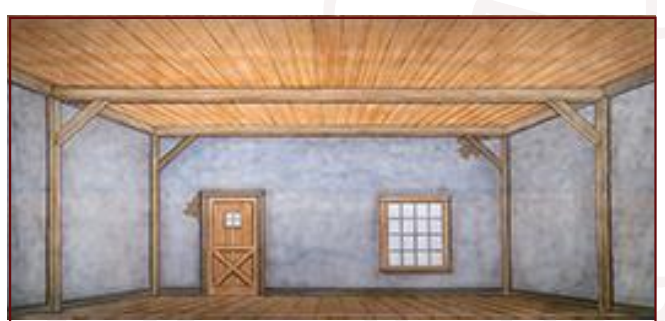
13-I. Rough Interior 39' x 20'6" - 36 lbs Overall gray interior with brown trim showing non-practical door and transparent window.