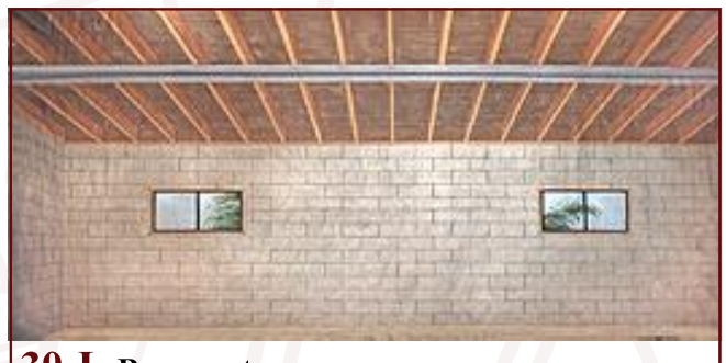
30-I. Basement 43' x 20' - 35 lbs Cement block wall with two basement windows and floor joist ceiling.