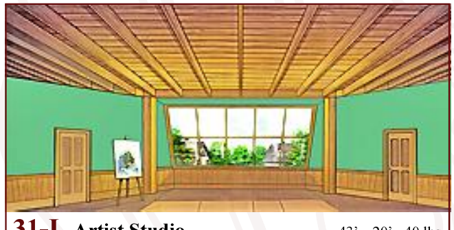
31-I. Artist Studio 43' x 20' - 40 lbs Loft room with large center window viewing buildings and trees. Wood open-beamed ceiling. Two non-practical doors.