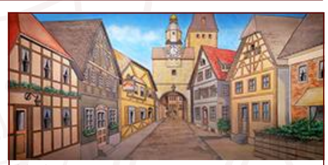
80-A. Bavarian Street

Shop with upper balcony filled with bolts of cloth. Lower level with storage cabinets, two windows and door, all non-practical.