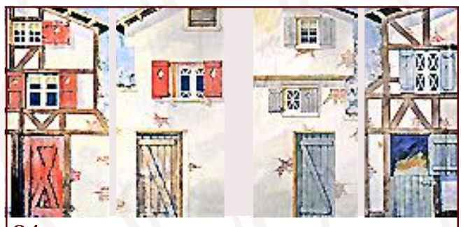
84. Old Country Tabs