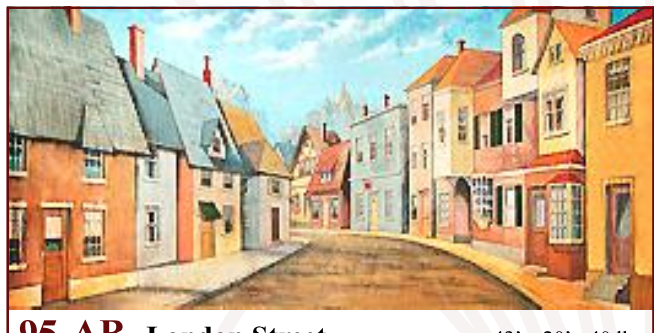
95-AB. London Street

Give us a call, and let us put a century of industry knowledge to work for you!