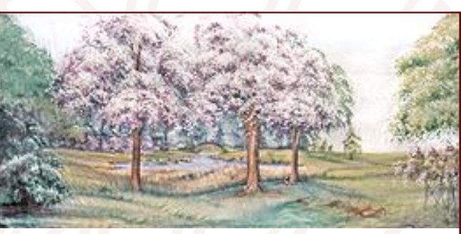
65-AB. Spring Landscape 30' x 16' - 25 lbs Spring landscape with trees and path in foreground.