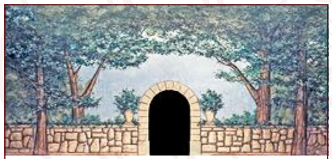
64. Garden 41^{\circ} \times 21^{\circ}9^{\circ} - 37 lbs Stone wall and filled flower vases with center practical arch. Opening size 3^{\circ}-0^{\circ} W \times 6^{\circ}8^{\circ} H approx.