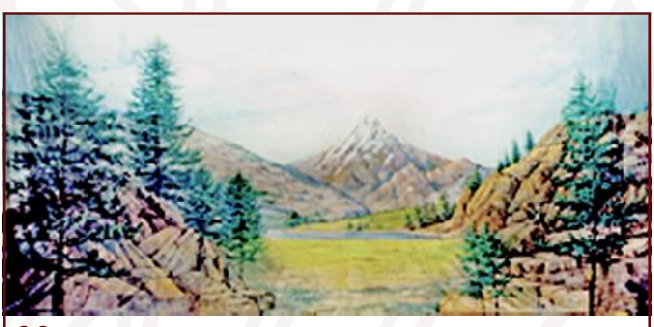
39. Mountain 42' x 20' - 40 lbs Snow-capped mountain in center, surrounded by fir trees and rocks.