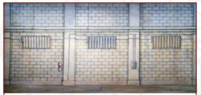
30-IA. Basement Typical basement with radiators.