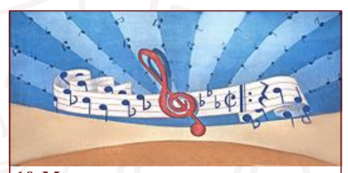
10–M. Musical Clef and Scale 38' x 21' - 30 lbs Centered G-clef with ribbon of music staff, background of rays with scattered notes.