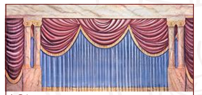
1-IA. Painted Red and Blue Drape 43' x 21'- 43 lbs Austrian puff drape falls behind marble columns.