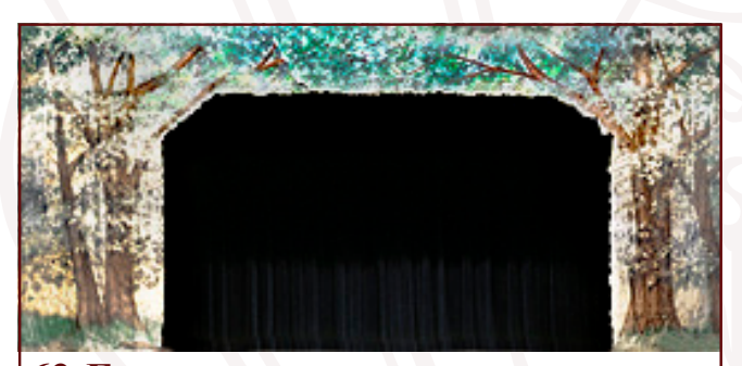
62-E. Foliage Leg & Border (3) 27'x 20'- 32 lbs (per set) Natural foliage legs and border. Borders overlap in center for desired opening.