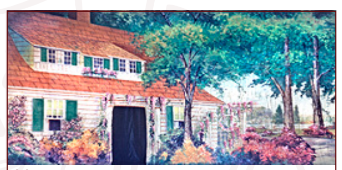
30. House and Garden 43' x 21' - 38 lbs House with practical door cut-out, surrounded by dense foliage and flowers. Opening is 5'W x 8'H approx.

11-M. Musical Ribbon Scale Musical ribbon staff cascading through G-clef. 38' x 21' - 33 lbs