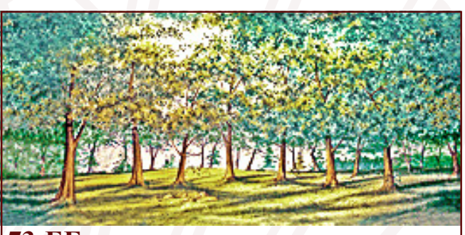
73-EE. Woods 43' x 21' - 40 lbs Clearing in a woods which is surrounded by tree trunks and dense top foliage.