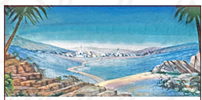
96. Holyland 39' x 21' - 35 lbs The Holy City is seen over a rock-tiered foreground, at the bottom of an open valley in far distance.

Our friendly staff is here to help you find the backdrop you need for your next production.