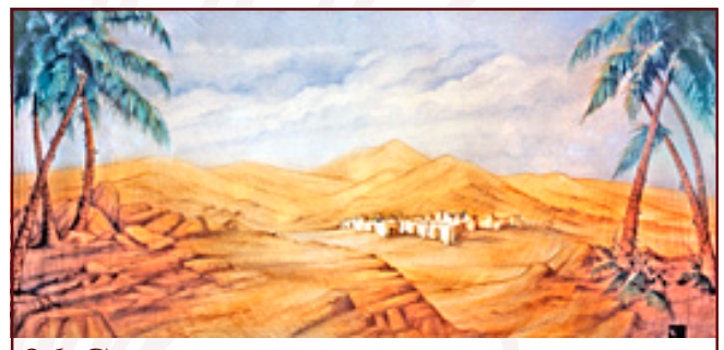
96-C. Holyland 43' x 21' - 37 lbs The Holy City is seen behind a walled fortress at the bottom of a sandy hillside. Rocks and palm trees in foreground.

Any reproduction without permission is strictly prohibited. Images are intended for reference only. Due to the variations in monitors and printers, accurate color representation is neither implied or guaranteed.