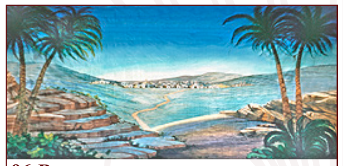
96-B. Holyland 30° x 16° - 22 lbs The Holy City is seen over a rock-tiered foreground, at the bottom of an open valley in far distance.