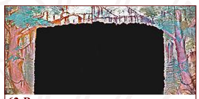
62–B. Southern Foliage Leg & Border 25'x21'-23 lbs Natural southern foliage with Spanish moss. Border overlaps in center for desired opening.

Big Top with entrance sign, featuring practical center opening.