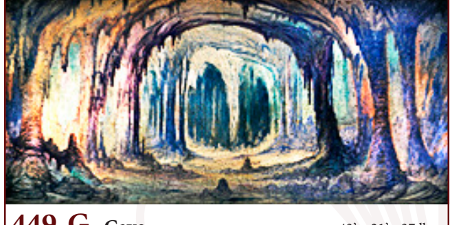
449-G. Cave 43' x 21' - 37 lbs Stalactites and stalagmites from columns, left and right, which lead to center. Opening is approximately 18'H x 20'W.