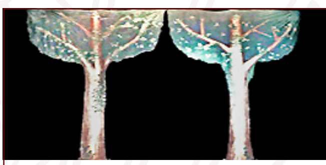
39-C. Tree Tab Set Cut-out stylized trees. (2) 20' x 12' - 8 lbs (total weight)