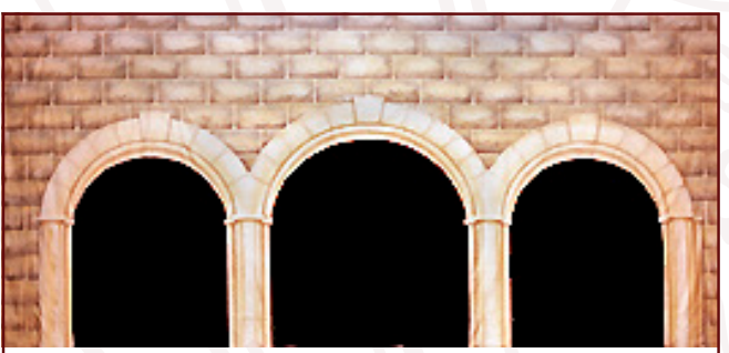
35-I. Stone Arch Three practical arched openings, stone block wall. center arch 16' high, left and right arches 14' high.