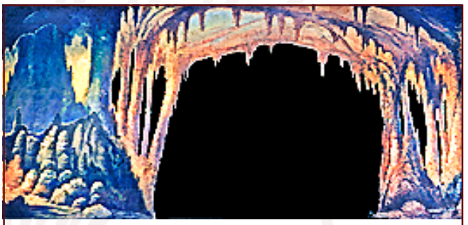
449-GG. Cave Cutout 40° x 22'6" - 36 lbs Cut opening in center views stalactites and other rock formations left and center. Opening is 20' W x 18' H approx.

All images Copyright © 2007 Schell Scenic Studio, Inc. Reproduction without permission is strictly prohibited. Images are intended for reference only. For color renditions of these backdrops, please visit www.SchellScenic.com to download our catalog.