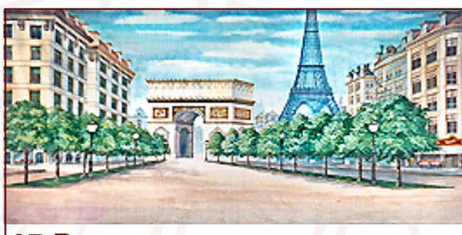
27-B. Paris Street 38' x 21' - 32 lbs Tree-lined boulevard in foreground with Arc de Triomphe and Eiffel Tower in near distance.