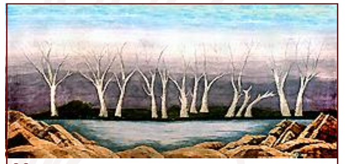
99. Lake Scrim 35' x 19' - 20 lbs Cut opening in center views stalactites and other rock formations left and center. Opening is 20' W x 18' H approx.

All images Copyright ©2005 - 2015 Schell Scenic Studio, Inc. Reproduction without permission is strictly prohibited. Images are intended for reference use only. Due to variations in monitors and printers, accurate color representation is neither implied nor guaranteed. All Images are low resolution, and will become pixelated if viewed above 200% magnification. Higher resolution photos are not available.