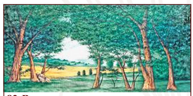
82-B. Open Woods 43' x 21' - 40 lbs Edge of dense forest looking through to rolling hills in distance.