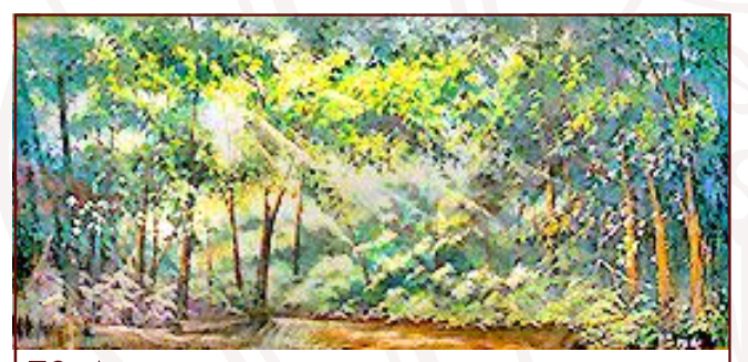
73-A. Woods 30' x 16' - 22 lbs Dense woods with shafts of sunlight piercing through heavy top foliage.

42-C. Sailing Ship 39' x 21' - 34 lbs Ship deck of typical wooden square-rigger showing mast, riggings and sail, railings and ocean.