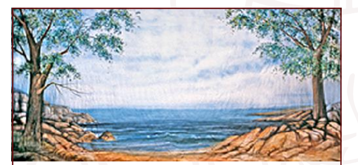
34-D. Ocean & Beach 43' x 21' - 41 lbs Trees and rocks frame a calm sea and cloud-filled sky.