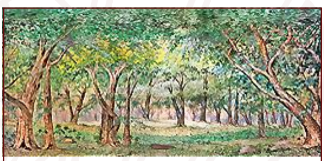
73-D. Woods 4: Clearing in a dense forest with heavy top foliage.