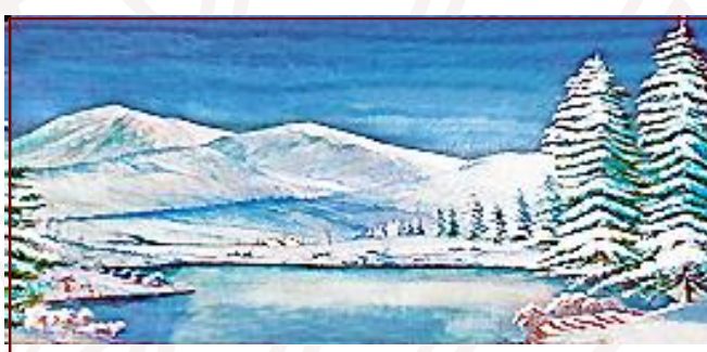
69-B. Winter Scene 43' x 21' - 35 lbs Snow-covered mountains and pine trees surround a lake in foreground.

Give us a call, and let us put a century of industry knowledge to work for you!